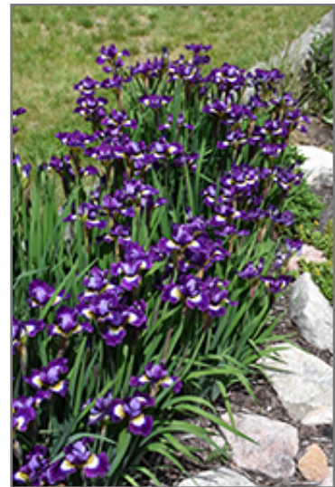
Jewelled Crown Siberian Iris in bloom