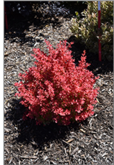
Sunjoy Neo Japanese Barberry

Sunjoy Neo Japanese Barberry makes a fine choice for the outdoor landscape, but it is also well-suited for use in outdoor pots and containers. It can be used either as 'filler' or as a 'thriller' in the 'spiller-thriller-filler' container combination, depending on the height and form of the other plants used in the container planting. It is even sizeable enough that it can be grown alone in a suitable container. Note that when grown in a container, it may not perform exactly as indicated on the tag - this is to be expected. Also note that when growing plants in outdoor containers and baskets, they may require more frequent waterings than they would in the yard or garden.