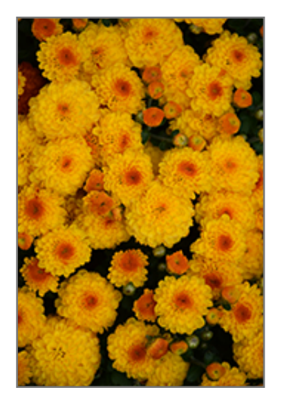
Gigi Gold Chrysanthemum flowers

830 W Liberty Dr. Liberty, MO 64068 816.781.0001