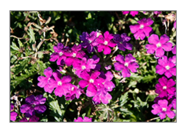
Beats Blue Verbena flowers

Early to flower and resistant to powdery mildew, this series features mounded habits with trailing tendencies; long lasting colorful blooms stand out against green foliage; excellent performance in containers, hanging baskets and landscapes