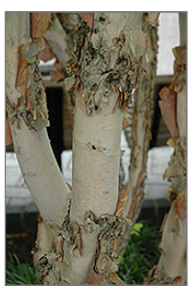
Fox Valley River Birch bark

830 W Liberty Dr. Liberty, MO 64068 816.781.0001