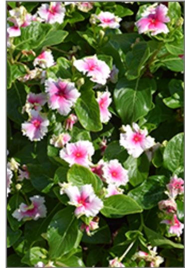
Soiree Flamenco Seniorita Pink Vinca in bloom

This plant will require occasional maintenance and upkeep, and should not require much pruning, except when necessary, such as to remove dieback. It is a good choice for attracting butterflies to your yard, but is not particularly attractive to deer who tend to leave it alone in favor of tastier treats. It has no significant negative characteristics.