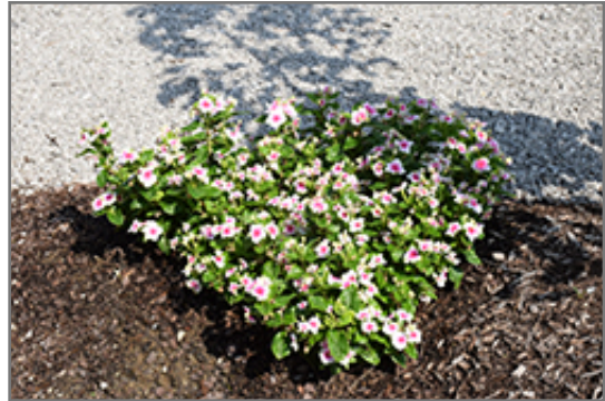
Soiree Flamenco Senorita Pink Vinca in bloom

Soiree Flamenco Senorita Pink Vinca is a fine choice for the garden, but it is also a good selection for planting in outdoor containers and hanging baskets. It is often used as a 'filler' in the 'spiller-thriller-filler' container combination, providing a mass of flowers against which the thriller plants stand out. Note that when growing plants in outdoor containers and baskets, they may require more frequent waterings than they would in the yard or garden.