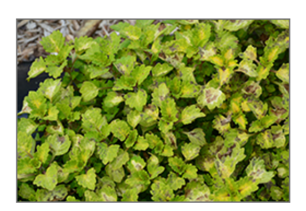
Great Falls Yosemite Coleus foliage

A perfect way to brighten up landscapes, hanging baskets or containers; this heat tolerant variety features small, chartreuse green leaves with lemon yellow centers and faint cherry red veining; plant in shaded areas as full sun will cause leave burn