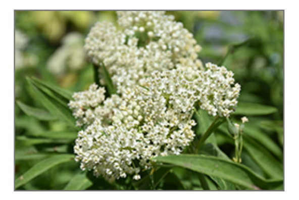
Ice Ballet Milkweed flowers

Ice Ballet Milkweed is recommended for the following landscape applications;