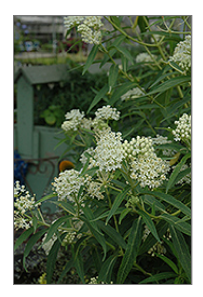
Ice Ballet Milkweed flowers

8424 Farley St. Overland Park, KS 66212 913.642.6503