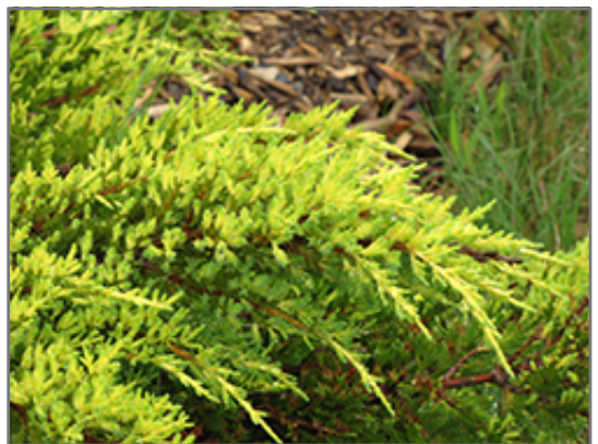
Daub's Frosted Juniper foliage

This is a relatively low maintenance shrub, and is best pruned in late winter once the threat of extreme cold has passed. Deer don't particularly care for this plant and will usually leave it alone in favor of tastier treats. It has no significant negative characteristics.