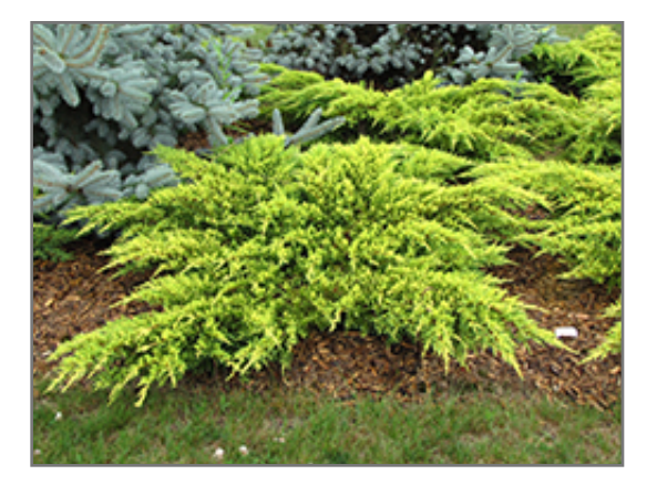
Daub's Frosted Juniper

Daub's Frosted Juniper is a multi-stemmed evergreen shrub with a ground-hugging habit of growth. It lends an extremely fine and delicate texture to the landscape composition which should be used to full effect.