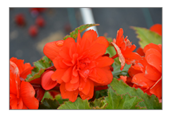
Nonstop Joy Orange Begonia flowers

830 W Liberty Dr. Liberty, MO 64068 816.781.0001