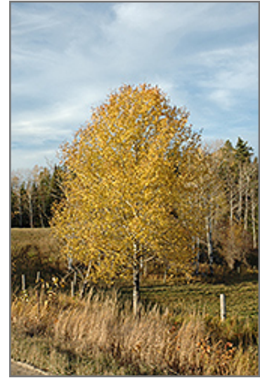
Trembling Aspen in fall

This tree should only be grown in full sunlight. It is an amazingly adaptable plant, tolerating both dry conditions and even some standing water. It is considered to be drought-tolerant, and thus makes an ideal choice for xeriscaping or the moisture-conserving landscape. It is not particular as to soil type or pH. It is quite intolerant of urban pollution, therefore inner city or urban streetside plantings are best avoided. This species is native to parts of North America.