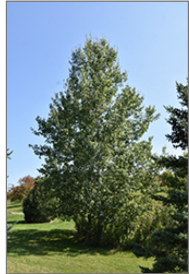
Trembling Aspen