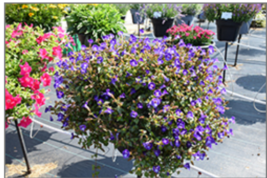
Summer Wave Bouquet Deep Blue Torenia in bloom