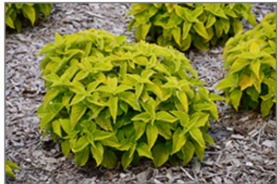
Chartres Street Coleus