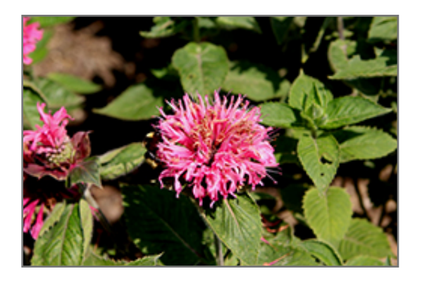
Bee-You Bee-Lieve Beebalm flowers

830 W Liberty Dr. Liberty, MO 64068 816.781.0001