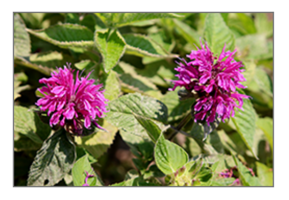
Bee-You Bee-Free Beebalm flowers

830 W Liberty Dr. Liberty, MO 64068 816.781.0001