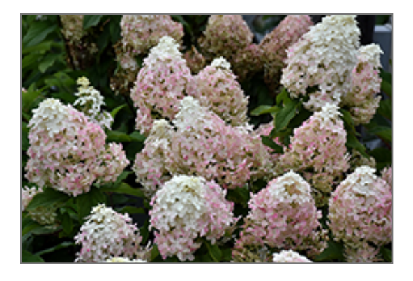
Quick Fire Fab Hydrangea flowers

830 W Liberty Dr. Liberty, MO 64068 816.781.0001