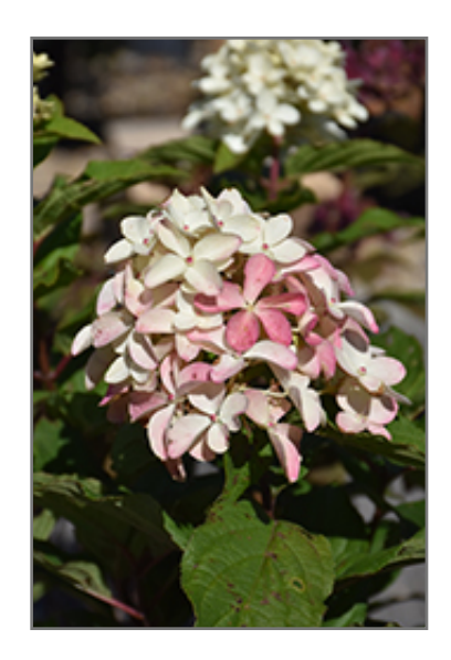
Quick Fire Fab Hydrangea flowers