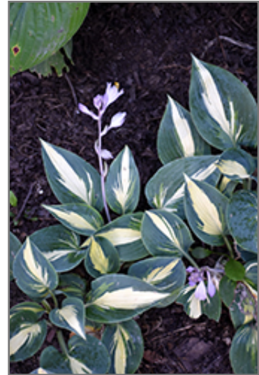
Magic Island Hosta foliage

A stunning hosta with small to medium, lightly cupped, thick, slug resistant leaves with sea-green margins and yellow flames that mature to light green; provides beautiful texture and contrast; lavender flowers appear in mid-summer