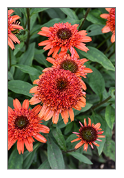
Moab Sunset Coneflower flowers

830 W Liberty Dr. Liberty, MO 64068 816.781.0001