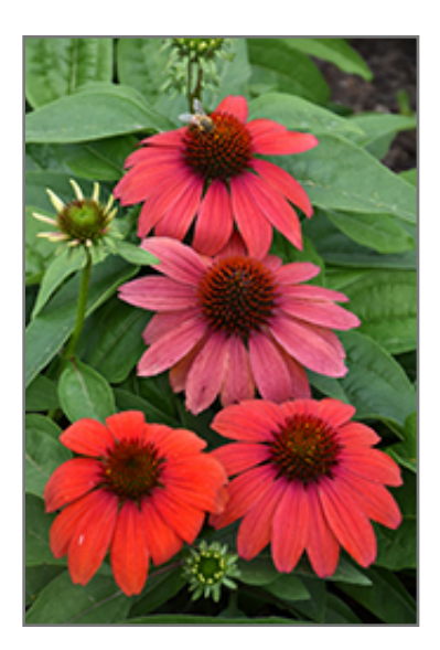
Artisan Red Ombre Coneflower flowers

8424 Farley St. Overland Park, KS 66212 913.642.6503