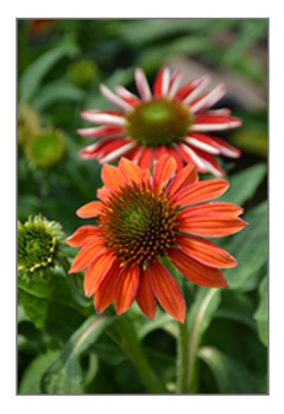
Artisan Red Ombre Coneflower flowers

Artisan Red Ombre Coneflower is recommended for the following landscape applications;