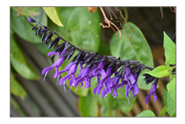
Purple & Bloom Sage flowers

Purple & Bloom Sage is recommended for the following landscape applications;