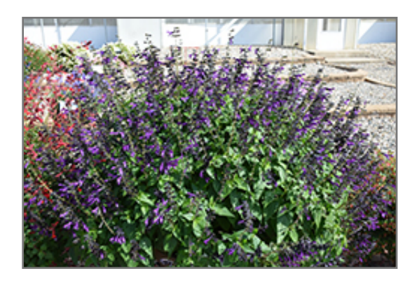
Purple & Bloom Sage in bloom

8424 Farley St. Overland Park, KS 66212 913.642.6503