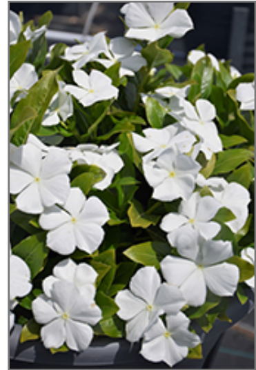
Cora Cascade White Vinca flowers

Cora Cascade White Vinca is recommended for the following landscape applications;