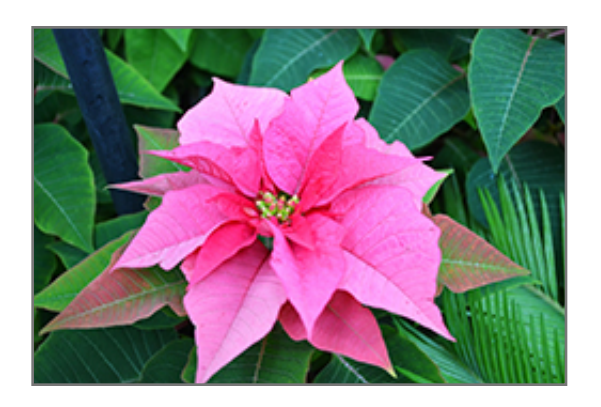
Princettia Pink Poinsettia flowers

830 W Liberty Dr. Liberty, MO 64068 816.781.0001