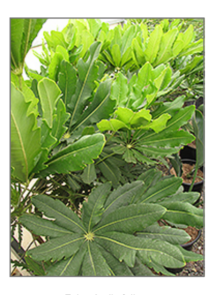
False Aralia foliage

When grown indoors, False Aralia can be expected to grow to be about 5 feet tall at maturity, with a spread of 24 inches. It grows at a medium rate, and under ideal conditions can be expected to live for approximately 10 years. This houseplant will do well in a location that gets either direct or indirect sunlight, although it will usually require a more brightly-lit environment than what artificial indoor lighting alone can provide. It prefers to grow in average to moist soil. The surface of the soil shouldn't be allowed to dry out completely, and so you should expect to water this plant once and possibly even twice each week. Be aware that your particular watering schedule may vary depending on its location in the room, the pot size, plant size and other conditions; if in doubt, ask one of our experts in the store for advice. It is not particular as to soil type or pH; an average potting soil should work just fine. Be warned that parts of this plant are known to be toxic to humans and animals, so special care should be exercised if growing it around children and pets.