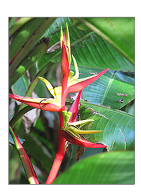
Lobster Claw flowers

Lobster Claw features showy spikes of yellow flowers with red bracts rising above the foliage from late spring to late summer. The flowers are excellent for cutting. Its large oval leaves remain dark green in color throughout the year.