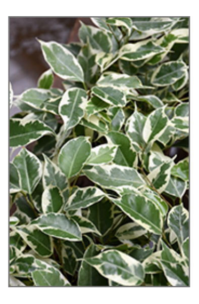
Starlight Weeping Fig foliage

When grown indoors, Starlight Weeping Fig can be expected to grow to be about 5 feet tall at maturity, with a spread of 3 feet. It grows at a medium rate, and under ideal conditions can be expected to live for approximately 50 years. This houseplant will do well in a location that gets either direct or indirect sunlight, although it will usually require a more brightly-lit environment than what artificial indoor lighting alone can provide. It does best in average to evenly moist soil, but will not tolerate standing water. The surface of the soil shouldn't be allowed to dry out completely, and so you should expect to water this plant once and possibly even twice each week. Be aware that your particular watering schedule may vary depending on its location in the room, the pot size, plant size and other conditions; if in doubt, ask one of our experts in the store for advice. It is not particular as to soil type or pH; an average potting soil should work just fine. Be warned that parts of this plant are known to be toxic to humans and animals, so special care should be exercised if growing it around children and pets.