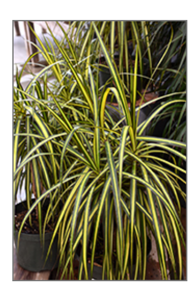
Kiwi Dracaena

When grown indoors, Kiwi Dracaena can be expected to grow to be about 6 feet tall at maturity, with a spread of 3 feet. It grows at a medium rate, and under ideal conditions can be expected to live for approximately 10 years. This houseplant performs well in both bright or indirect sunlight and strong artificial light, and can therefore be situated in almost any well-lit room or location. It does best in average to evenly moist soil, but will not tolerate standing water. The surface of the soil shouldn't be allowed to dry out completely, and so you should expect to water this plant once and possibly even twice each week. Be aware that your particular watering schedule may vary depending on its location in the room, the pot size, plant size and other conditions; if in doubt, ask one of our experts in the store for advice. It is not particular as to soil type or pH; an average potting soil should work just fine.