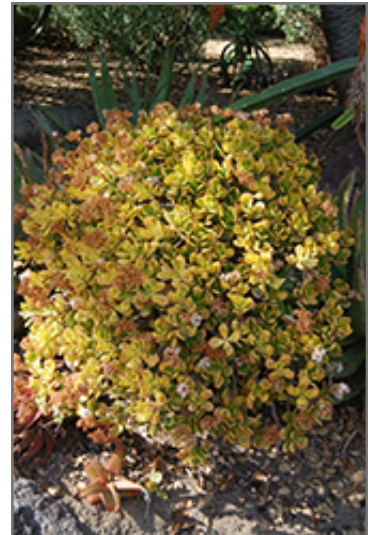
Hummel's Sunset Golden Jade Plant in bloom