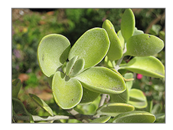
Silver Teaspoons foliage

This is a relatively low maintenance plant, and should not require much pruning, except when necessary, such as to remove dieback. It has no significant negative characteristics.