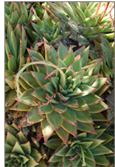
Molded Wax Echeveria foliage