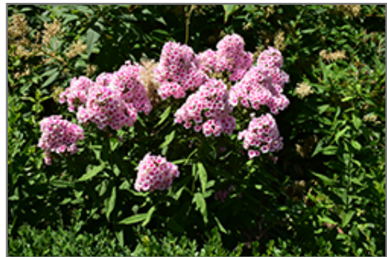
Bright Eyes Garden Phlox in bloom