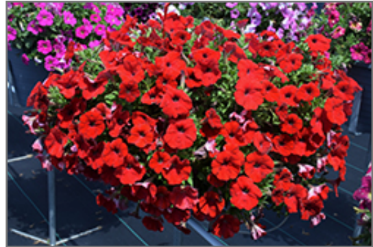
Capella Ruby Red Petunia in bloom

Capella Ruby Red Petunia will grow to be about 12 inches tall at maturity, with a spread of 16 inches. When grown in masses or used as a bedding plant, individual plants should be spaced approximately 12 inches apart. Its foliage tends to remain dense right to the ground, not requiring facer plants in front. This fast-growing annual will normally live for one full growing season, needing replacement the following year.