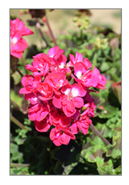
Calliope Medium Hot Rose Geranium flowers

830 W Liberty Dr. Liberty, MO 64068 816.781.0001