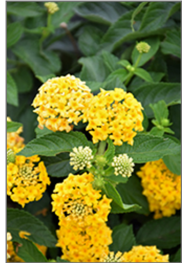
Landscape Bandana Yellow Lantana flowers

Landscape Bandana Yellow Lantana is recommended for the following landscape applications;