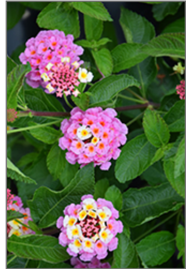
Landscape Bandana Pink Lantana flowers

Landscape Bandana Pink Lantana is recommended for the following landscape applications;