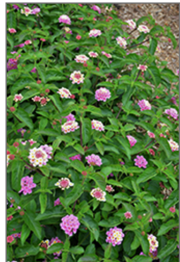
Landscape Bandana Pink Lantana in bloom