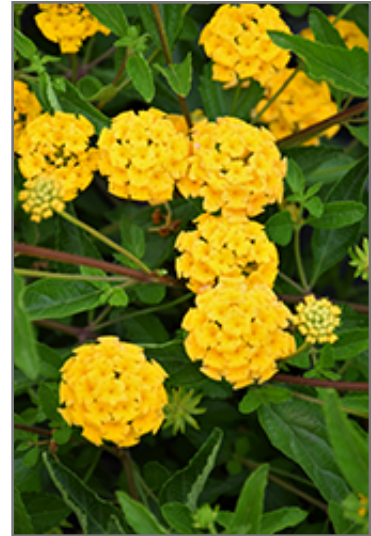
Landscape Bandana Gold Lantana flowers

Landscape Bandana Gold Lantana is recommended for the following landscape applications;