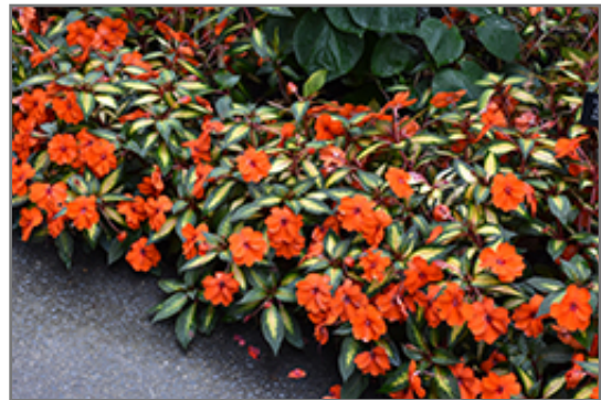
SunPatiens Vigorous Tropical Orange New Guinea Impatiens in bloom