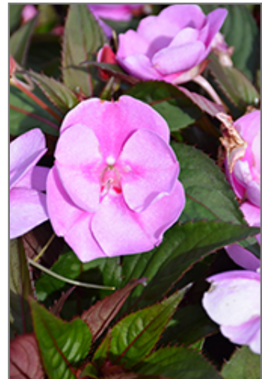
SunPatiens Vigorous Lavender Splash New Guinea Impatiens flowers