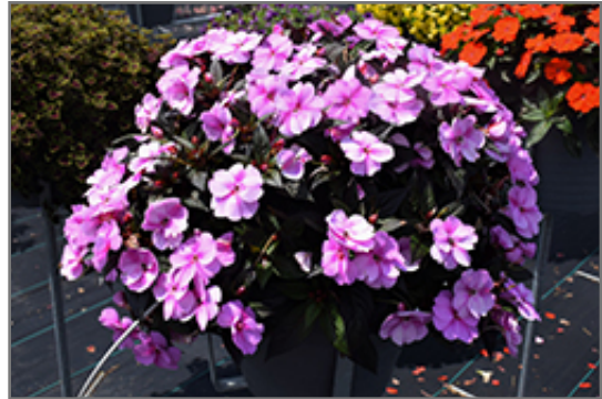
SunPatiens Vigorous Lavender Splash New Guinea Impatiens in bloom

SunPatiens Vigorous Lavender Splash New Guinea Impatiens is a fine choice for the garden, but it is also a good selection for planting in outdoor containers and hanging baskets. Because of its height, it is often used as a 'thriller' in the 'spiller-thriller-filler' container combination; plant it near the center of the pot, surrounded by smaller plants and those that spill over the edges. It is even sizeable enough that it can be grown alone in a suitable container. Note that when growing plants in outdoor containers and baskets, they may require more frequent waterings than they would in the yard or garden.