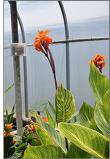
Bengal Tiger Canna flowers

This plant should only be grown in full sunlight. It requires an evenly moist well-drained soil for optimal growth, but will die in standing water. It is not particular as to soil pH, but grows best in rich soils. It is highly tolerant of urban pollution and will even thrive in inner city environments, and will benefit from being planted in a relatively sheltered location. Consider applying a thick mulch around the root zone in winter to protect it in exposed locations or colder microclimates. This particular variety is an interspecific hybrid. It can be propagated by division; however, as a cultivated variety, be aware that it may be subject to certain restrictions or prohibitions on propagation.