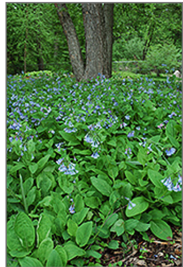
Virginia Bluebells in bloom