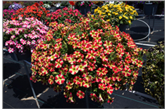
Amore Queen of Hearts Petunia in bloom

Amore Queen of Hearts Petunia will grow to be about 12 inches tall at maturity, with a spread of 14 inches. When grown in masses or used as a bedding plant, individual plants should be spaced approximately 10 inches apart. Its foliage tends to remain dense right to the ground, not requiring facer plants in front. This fast-growing annual will normally live for one full growing season, needing replacement the following year.