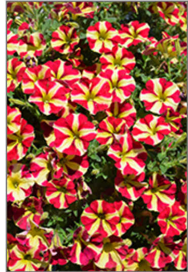
Amore Queen of Hearts Petunia flowers

This plant will require occasional maintenance and upkeep. Trim off the flower heads after they fade and die to encourage more blooms late into the season. It is a good choice for attracting butterflies and hummingbirds to your yard, but is not particularly attractive to deer who tend to leave it alone in favor of tastier treats. It has no significant negative characteristics.