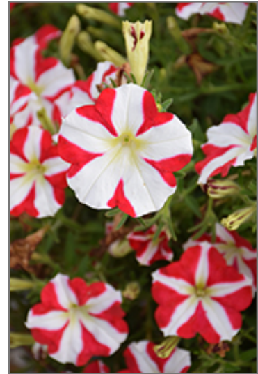
Amore King of Hearts Petunia flowers

Amore King of Hearts Petunia is recommended for the following landscape applications;