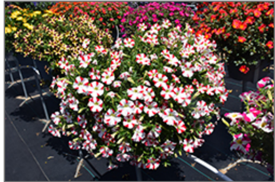
Amore King of Hearts Petunia in bloom

Amore King of Hearts Petunia will grow to be about 12 inches tall at maturity, with a spread of 14 inches. When grown in masses or used as a bedding plant, individual plants should be spaced approximately 10 inches apart. Its foliage tends to remain dense right to the ground, not requiring facer plants in front. This fast-growing annual will normally live for one full growing season, needing replacement the following year.