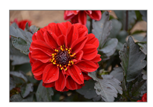
City Lights Red Dahlia flowers

This beautiful bi-colored variety features stunning red blooms sitting on top of deep dark green foliage; ideal for boarders, patio containers and fresh cut flower bouquets; drought tolerant; attracts birds and butterflies