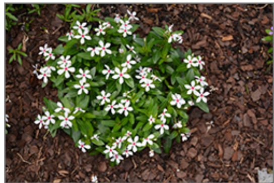
Soiree Kawaii White Peppermint Vinca in bloom