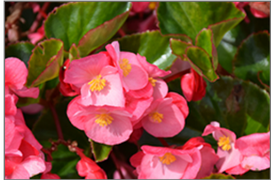
Viking Pink on Green Begonia flowers

Viking Pink on Green Begonia is recommended for the following landscape applications;