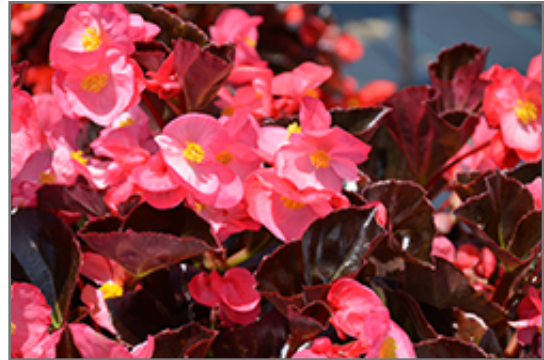
Viking Pink on Chocolate Begonia flowers

Viking Pink on Chocolate Begonia is recommended for the following landscape applications;