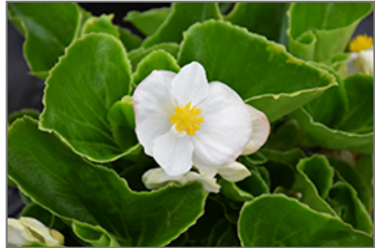
Tophat White Begonia flowers

Tophat White Begonia is recommended for the following landscape applications;