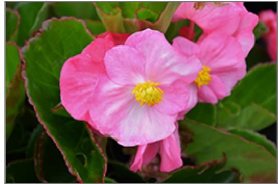
Tophat Pink Begonia flowers

Tophat Pink Begonia is recommended for the following landscape applications;