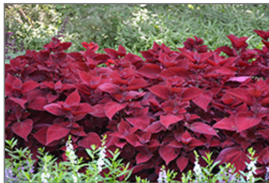
Beale Street Coleus

8424 Farley St. Overland Park, KS 66212 913.642.6503