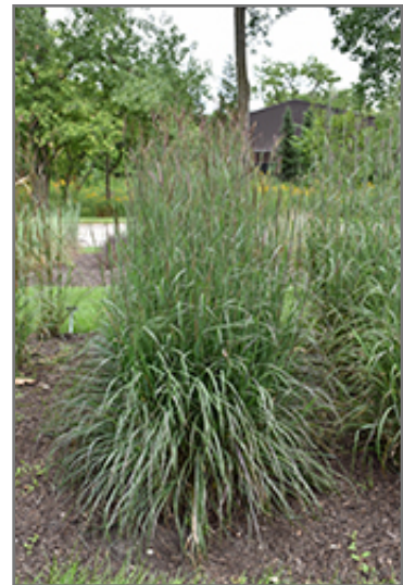
Blackhawks Bluestem in bloom