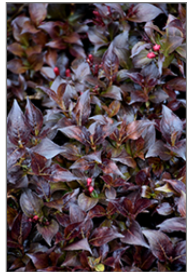
Coco Krunch Weigela foliage